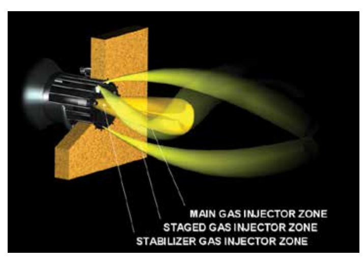
Advanced CFD modeling on every burner